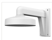
DS-1272ZJ-120 Wall mount